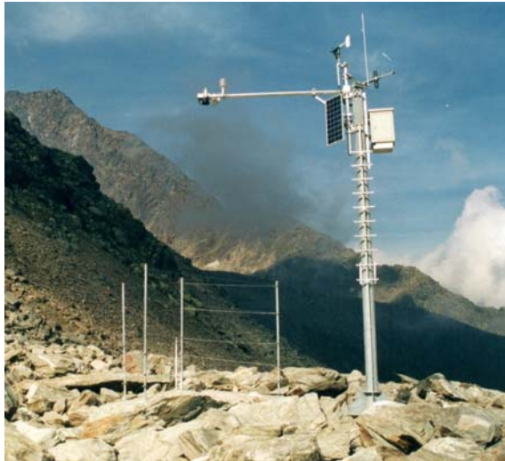
fig. 1: automatic snow station for avalanche warning (Simplon 2420 m.a.s.l.)

In the last few years automatic snow and weather stations have become an important tool for practitioners dealing with alpine hazards in the Swiss Alps. By now more than 150 of our automatic snow and wind measurement stations for avalanche warning (cf. figure 1), 15 alarm stations for different alpine hazards and scientific stations on glaciers provide important data for warning, protection and scientific research. These stations are operated autonomously throughout the year. They run under high alpine environmental conditions with a minimum of maintenance. The understanding of the physically correct way of measuring is as important for obtaining good and reliable data as is an optimal design of the stations. This includes the data acquisition, energy supply and communication subsystems as well as the mechanical structure. Furthermore, the wide range of available sensors and the use of specifically developed measurement systems offer interesting solutions for automatic stations on glaciers.